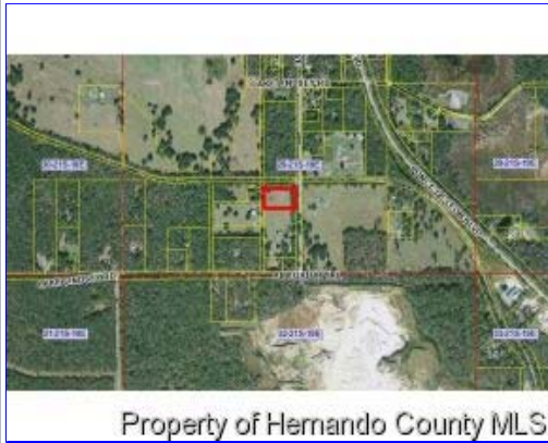
Property of Hernando County MLS

Subdivision: Stafford Current Zoning: AG DOR Use Code: 60 Style: Acreage Hernando County Tax Link Contact Property Appraiser (352) 754-4190 Water Onsite: No Septic/Swr Onsite: No Power Onsite: No Elem. School: Brooksville Mid. School: Parrot High School: Hernando School Yr-Yr: 2009-2010 Acres: 3.76 Lot Dim. Approx: Lot Dim. Source: Lot SqFt: Acreage Info: Over 2 to 4 Acres Addl Acreage: Yes Apx Rd Frntge: Paved Rd: Yes Rear Exposure: Waterfront: No Apx Wtr Frntge: Greenbelt: Yes City/Co. Special Assmnt: Yes